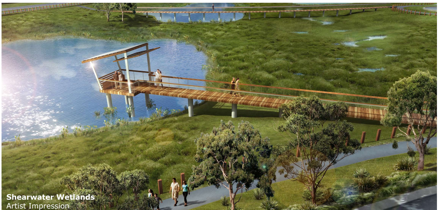
Shearwater Wetlands Artist Impression

For more information, visit our new website at www.shearwaterestate.com.au